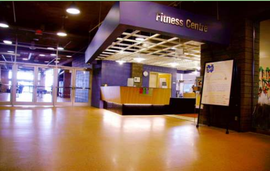
Calgary Recreation Center Alberta, Canada