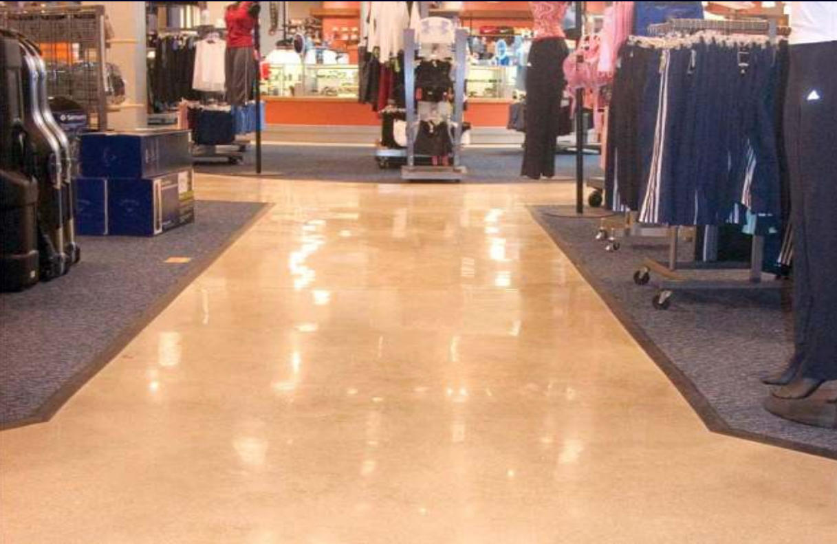
Dick's Sporting Goods • Orland Park, Illinois

“This floor is about the easiest to maintain I've ever seen.”