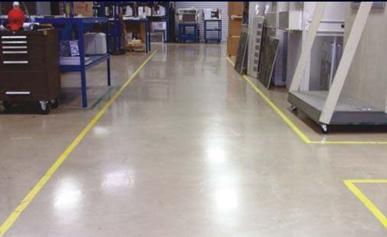
Friedrich Air Conditioning • San Antonio, Texas

“The FGS floor in the R&D area has performed so well, I’ll try to budget additional square footage in this building. It’s well worth the investment!”