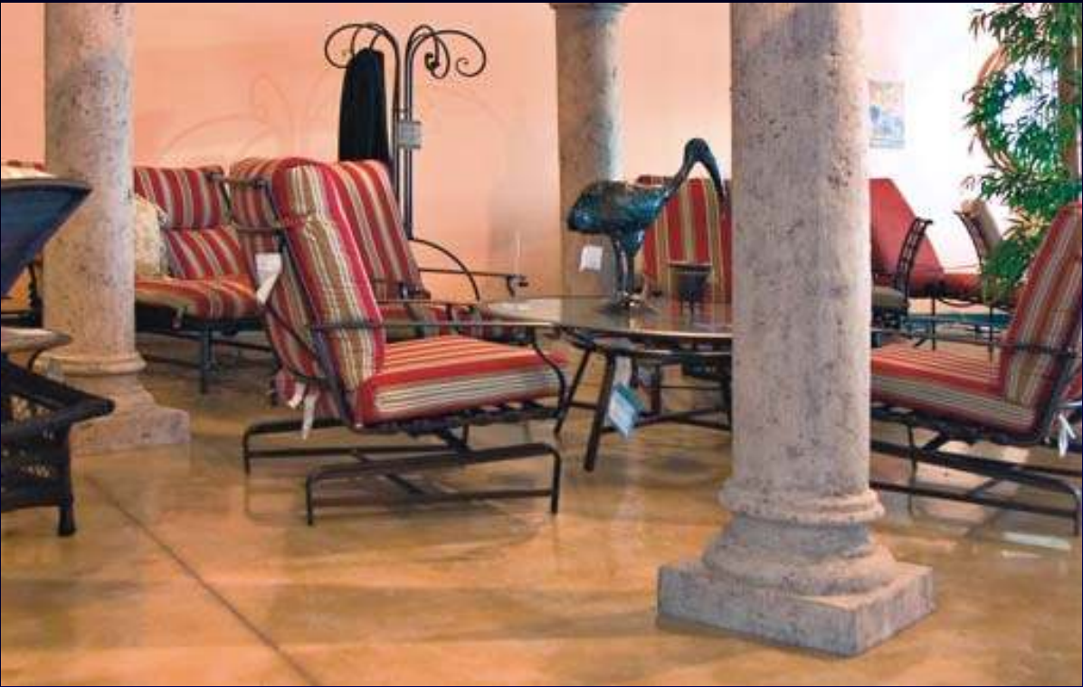
Greenhouse Mall Furniture • San Antonio, Texas

“The FGS polished concrete looks great to the customer and complements our type of merchandise well.”