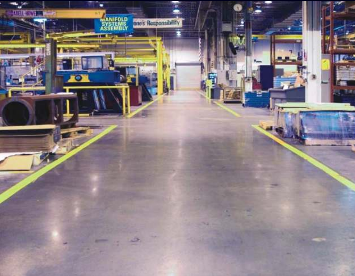
FMC Fluid Control • Stephenville, Texas

“The heavy manufacturing here would take a toll on any other kind of floor. The FGS floor holds up to the abuse day-in, day-out!”